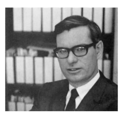
Fig. 4 Kenneth E. F. Watt

Watt's methodology involved four components: measurement, analysis, description, and simulation.